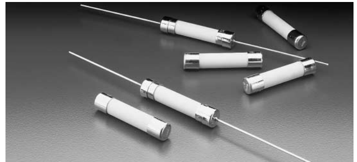
326 000 Series